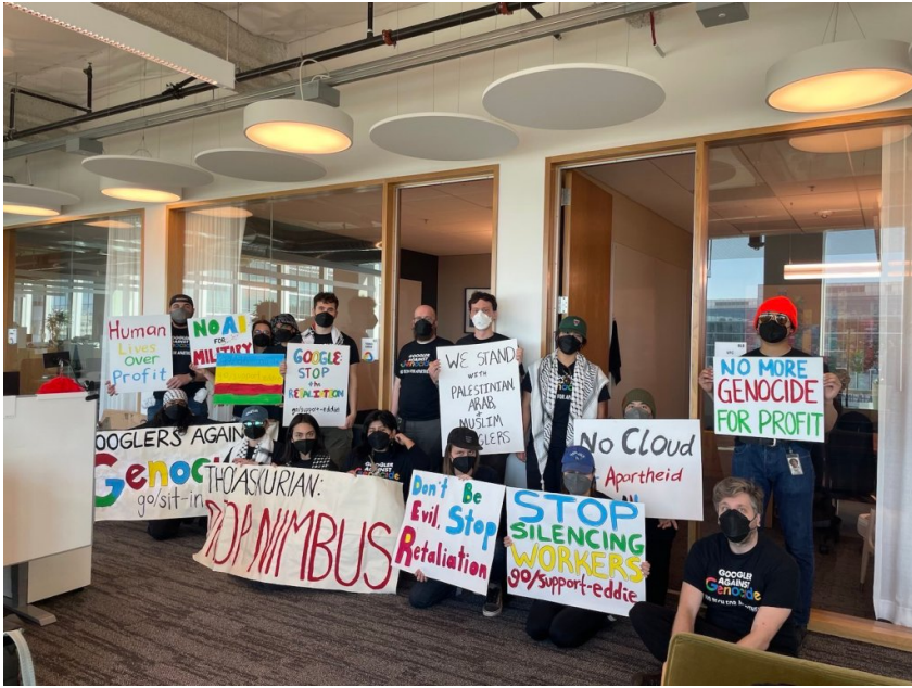
A large group of Google employees hold signs protesting their company's participation in "Project Nimbus."

Google employees read statements denouncing the company for its ties to the Israeli government on Tuesday. Twitch/notech4apartheid