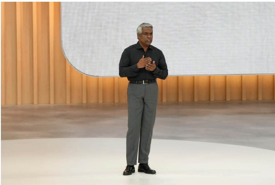
Kurian's office is based in Google Cloud headquarters in Sunnyvale, Calif. Kurian is seen above in May 2023.

The activists appear to have also scribbled some pro-Palestinian slogans and statements on Kurian's bulletin board — accusing the company of “harassment, bullying and censorship” of Arab and Muslim employees.