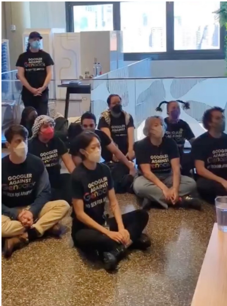
Google employees wore shirts denouncing their company for aiding Israel's "genocide."