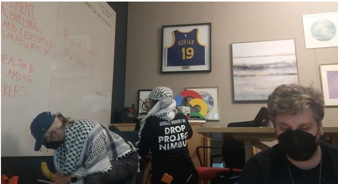
The employees, who are members of an organization called "No Tech For Apartheid," livestreamed the sit-in on Twitch.

A custom-made Golden State Warriors basketball jersey with Kurian's name is seen hanging on the wall in the background.