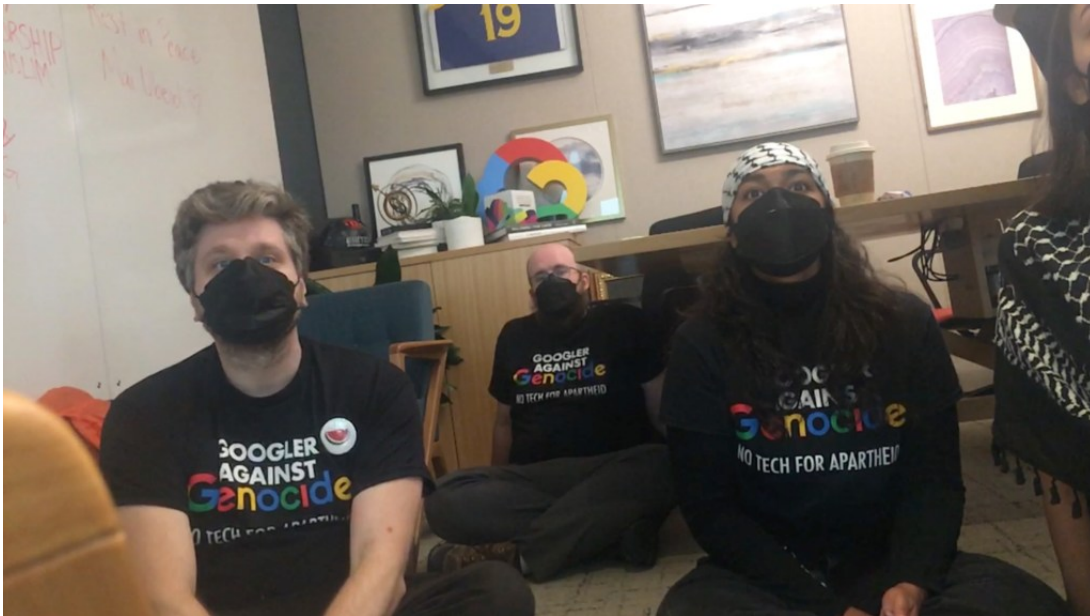
Some of the activist-employees wore traditional Arab headscarves and covered their faces.