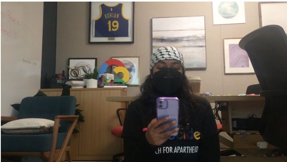
Pro-Palestinian Google employees took over the office of Google Cloud CEO Thomas Kurian on Tuesday.

The activist workers read statements denouncing the company over its contract with the Israel government, which the group accuses of carrying out a "genocide" in its bombing campaign in the Gaza Strip — following the Hamas massacre of Israelis on Oct. 7.